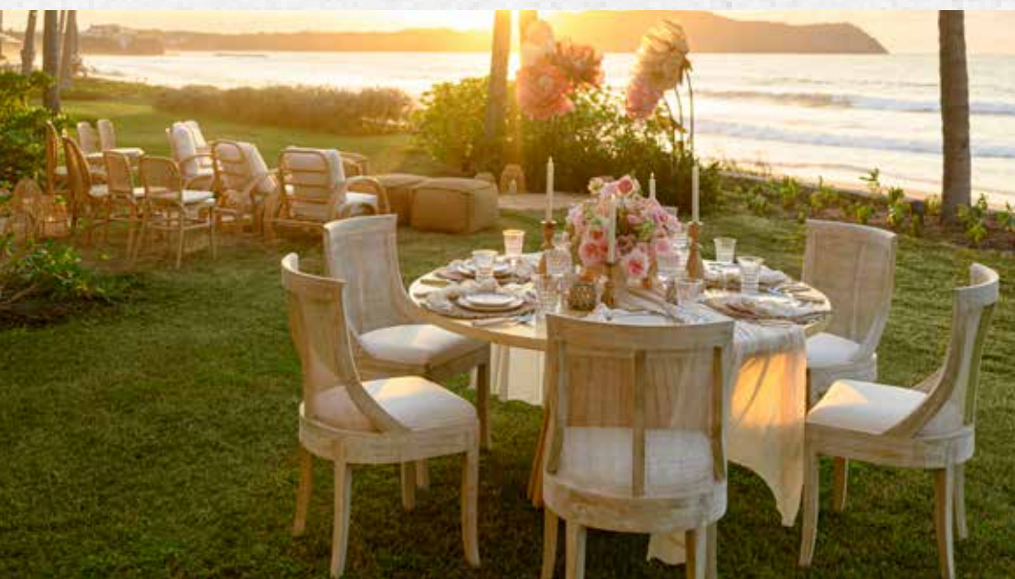
Share your special day with up to 10 family members and close friends in the intimate Tui Garden. Both the ceremony and reception dinner share the same space.