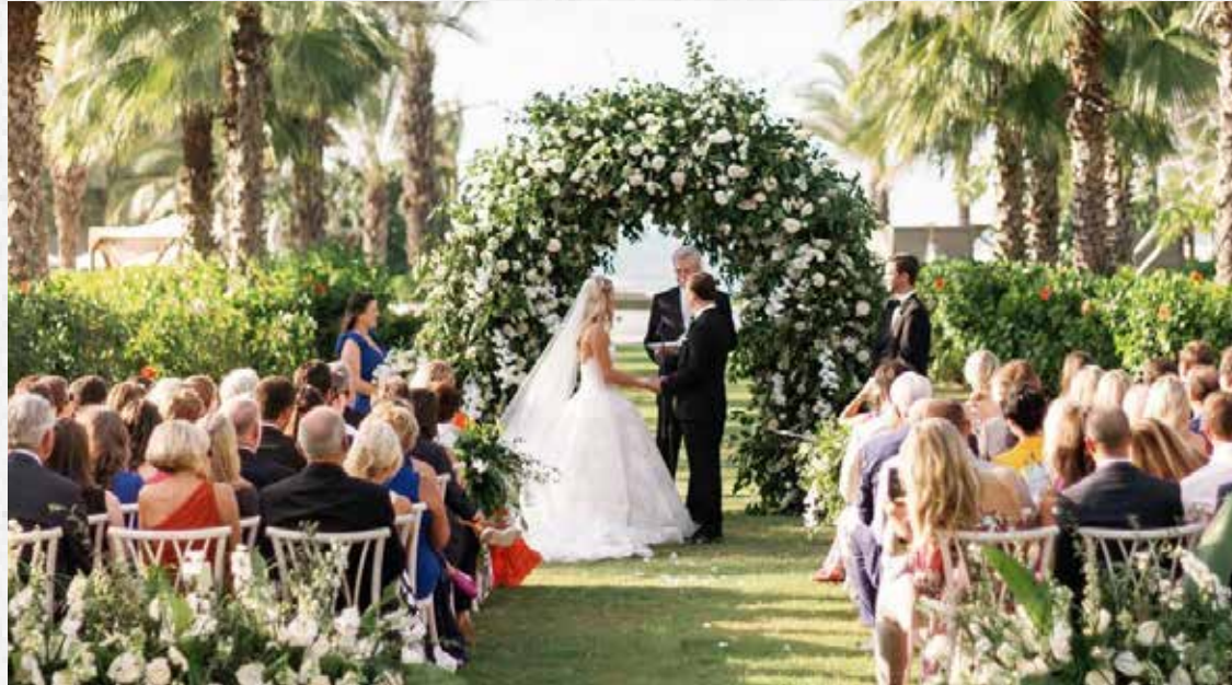
At the heart of the resort, Haramara Lawn's spacious landscaping and palm lined borders frame a dramatic Pacific ocean backdrop for your ceremony.